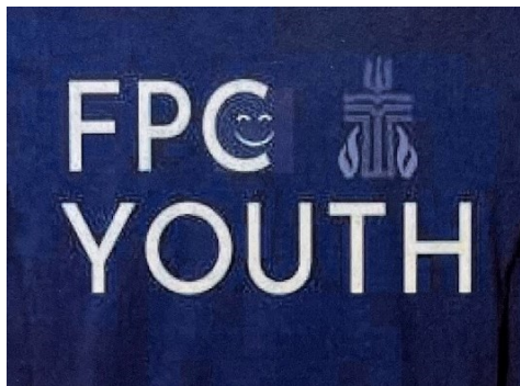
For back of shirt