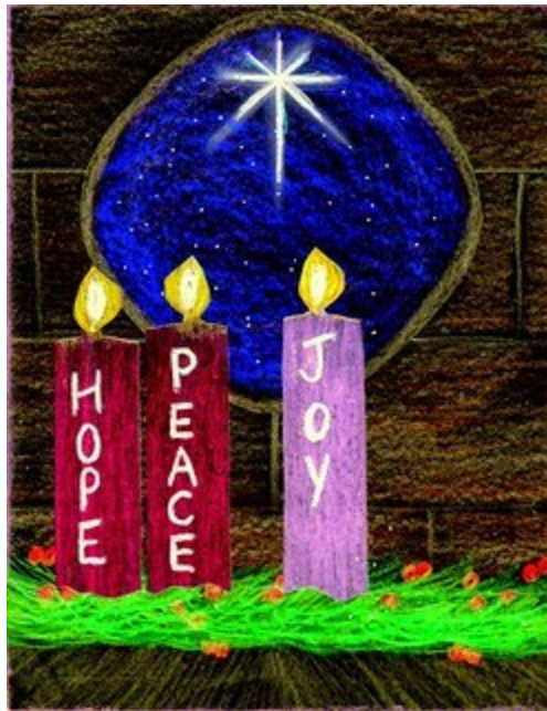
Third Week of Advent